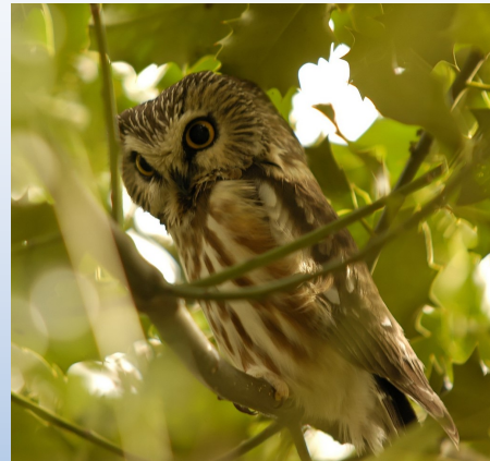
Sawwhet Owl